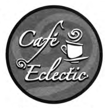
603 N. McLean Blvd. Memphis, TN 725-1718