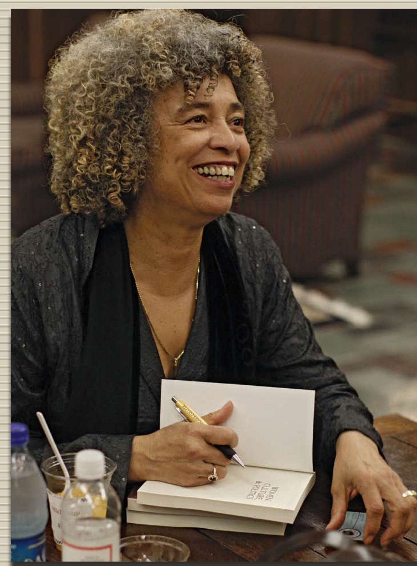
Dr. Angela Davis - keynote speaker, ACS 8th biennial Women's and Gender Studies Conference