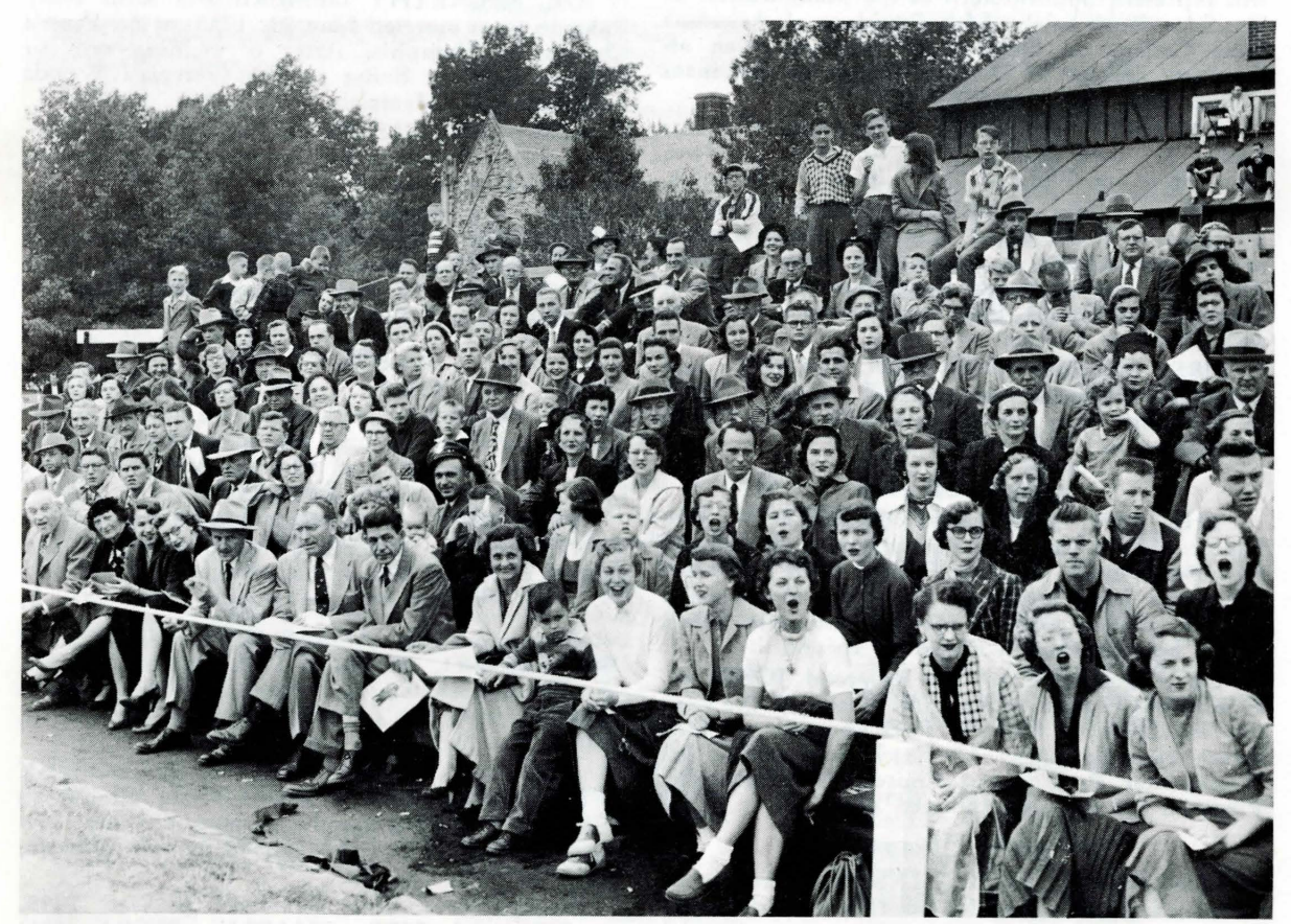
In this view of the Homecomers, the faces of many alumni appear.

After the game, all fraternities held open house, followed by the Homecoming Dance in the Gymnasium from 9 until 12.