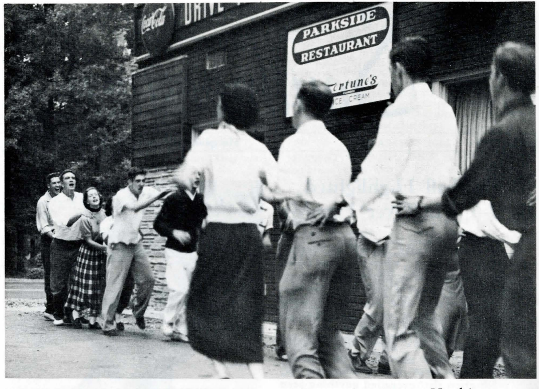
Snakedancers at Parkside Restaurant following the win over Hendrix.