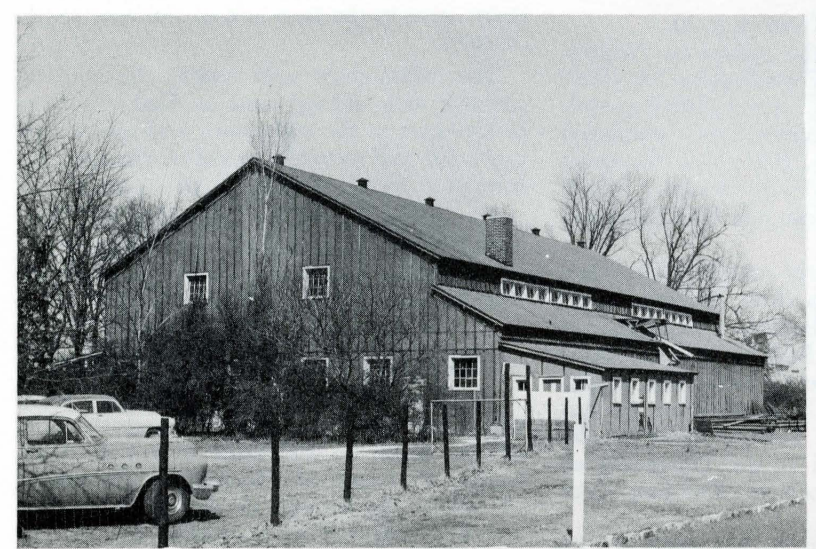
Farewell to Fargason Field House, which saw its last basketball game on February 20. It is pleasant to report that the curtain was rung down with a win and that the opponent was so worthy a rival as Sewanee. No decision has been reached concerning the eventual fate of the twenty-nine-year-old Fargason.