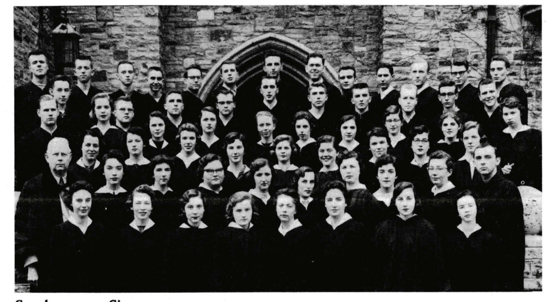
Southwestern Singers —

Admissions Counselor Southwestern at Memphis Memphis 12, Tenn.