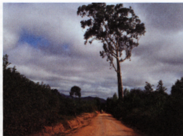
Figure 3. The tree that serves as the "life-orienting target" of the house of another ritual specialist.

not only of the abstract sign, but also one of the materiality, sensuality, and affectivity of icon and index.