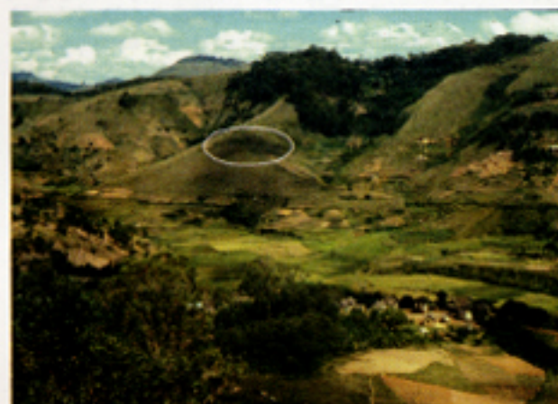
Figure 2. The point on the landscape that serves as the “life-orienting target” of the house of a ritual specialist.