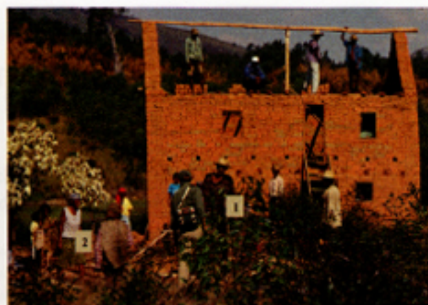
Figure 1. The orienting of the central beam of the new house of a ritual specialist (1) and his wife (2).

this tanjom-belona among “restored” vegetation; this is a further testament to the acuity of the original orientation.