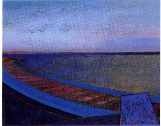
River #2 | 15" x 19" | Oil on canvas | 2005

As she moves away from the source, strange things happen to the view. The horizon line tends to move upwards, pushing it to the upper border of the image or out of it altogether. This creates space with little vertical extent, something enclosed, a private inner space. When the image seems to settle on an initial point of perspective, the airless space undergoes a gestalt shift and the lines of a mid-distance landscape start