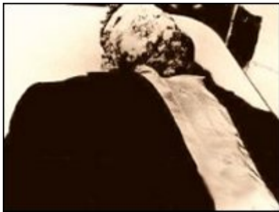
12 – Body of Emmett Till