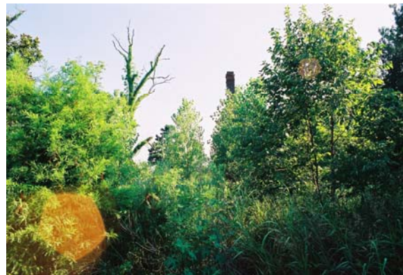
4 – Moses Wright's house site, 2005