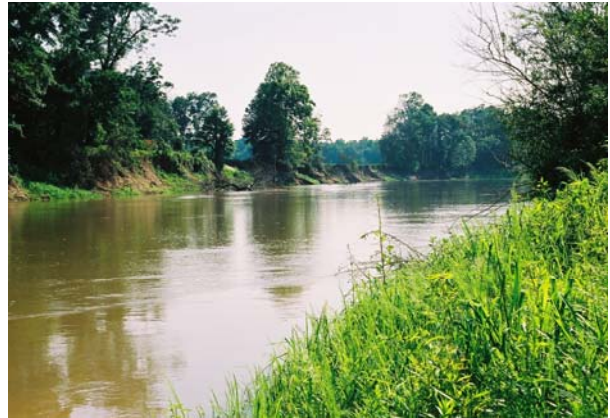
6 – Tallahatchie River