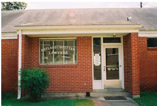
8 – Breland & Whitten Lawyers