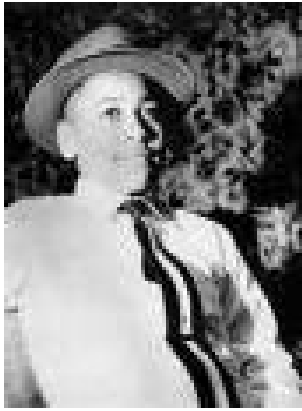
1 – Emmett Louis Till