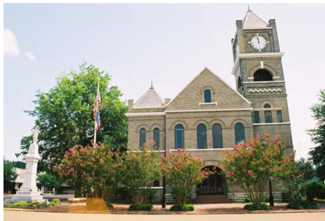
7A & B – Tallahatchie County Courthouse, Sumner, 1955 and 2005