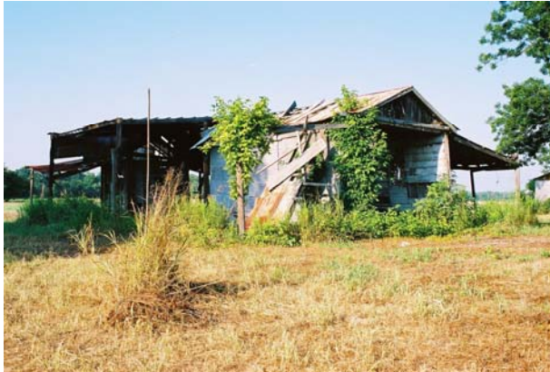
5 – Shed behind Milam’s house