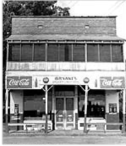
2A – Bryant's Grocery, 1955