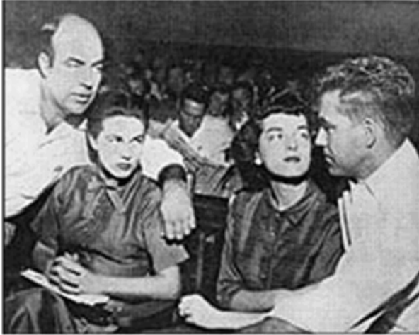
10 – J.W. & Juanita Milam, Carolyn & Roy Bryant