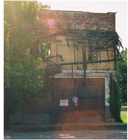
2B – Bryant's Grocery, 2005