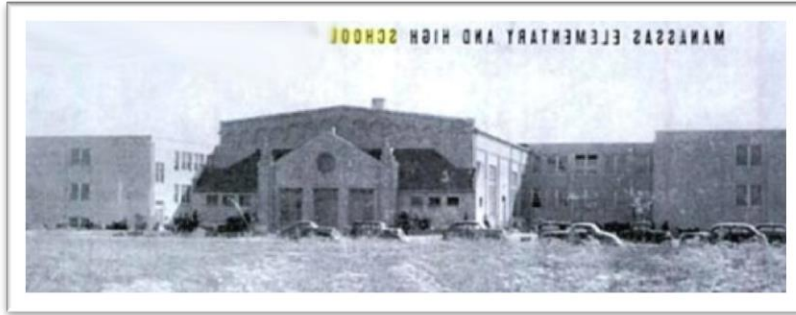
Figure 1: Old Manassas High School 16