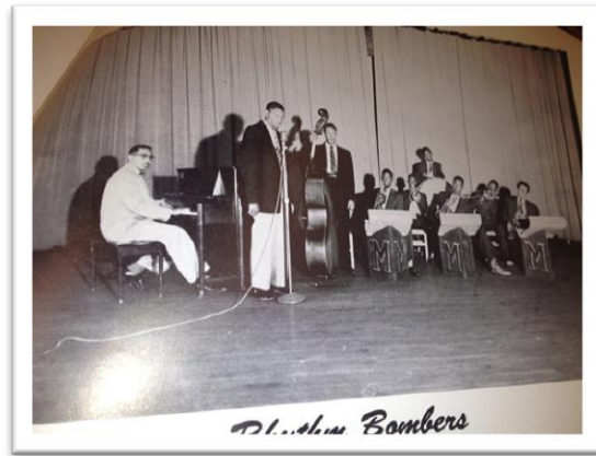
Figure 3: Rhythm Bombers performing at the Annual Show in 1955 56