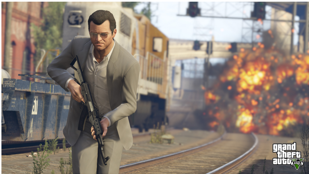
[Pictured Above: Michael DeSanta, one of the protagonists of GTA V]<sup>101</sup>

gives it a 97/100. <sup>98</sup> Game Spot gave it a 9/10 twice. <sup>99</sup> The game smashed an astonishing six world sales records, including becoming the fastest entertainment property to gross a billion dollars. <sup>100</sup>