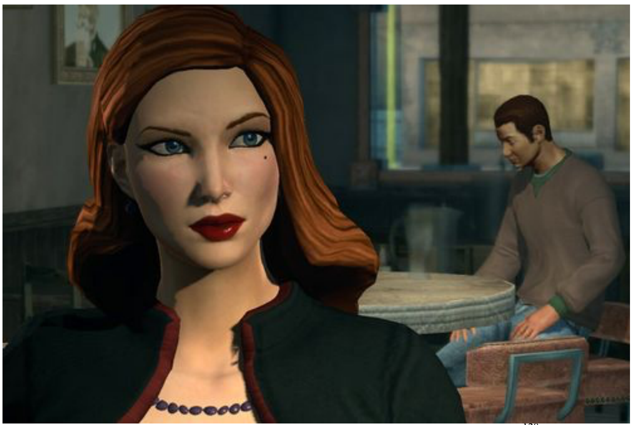
[Pictured Above: A Female Saints Row: the Third Protagonist Avatar] 128

The protagonist, whether male or female, has three female characters as allies, two of whom she gains during the course of the game. One of the primary antagonists is also a woman, the Senator Monica Hughes, who is understandably upset when her husband's memorial bridge is destroyed by gang violence on the day of its opening.