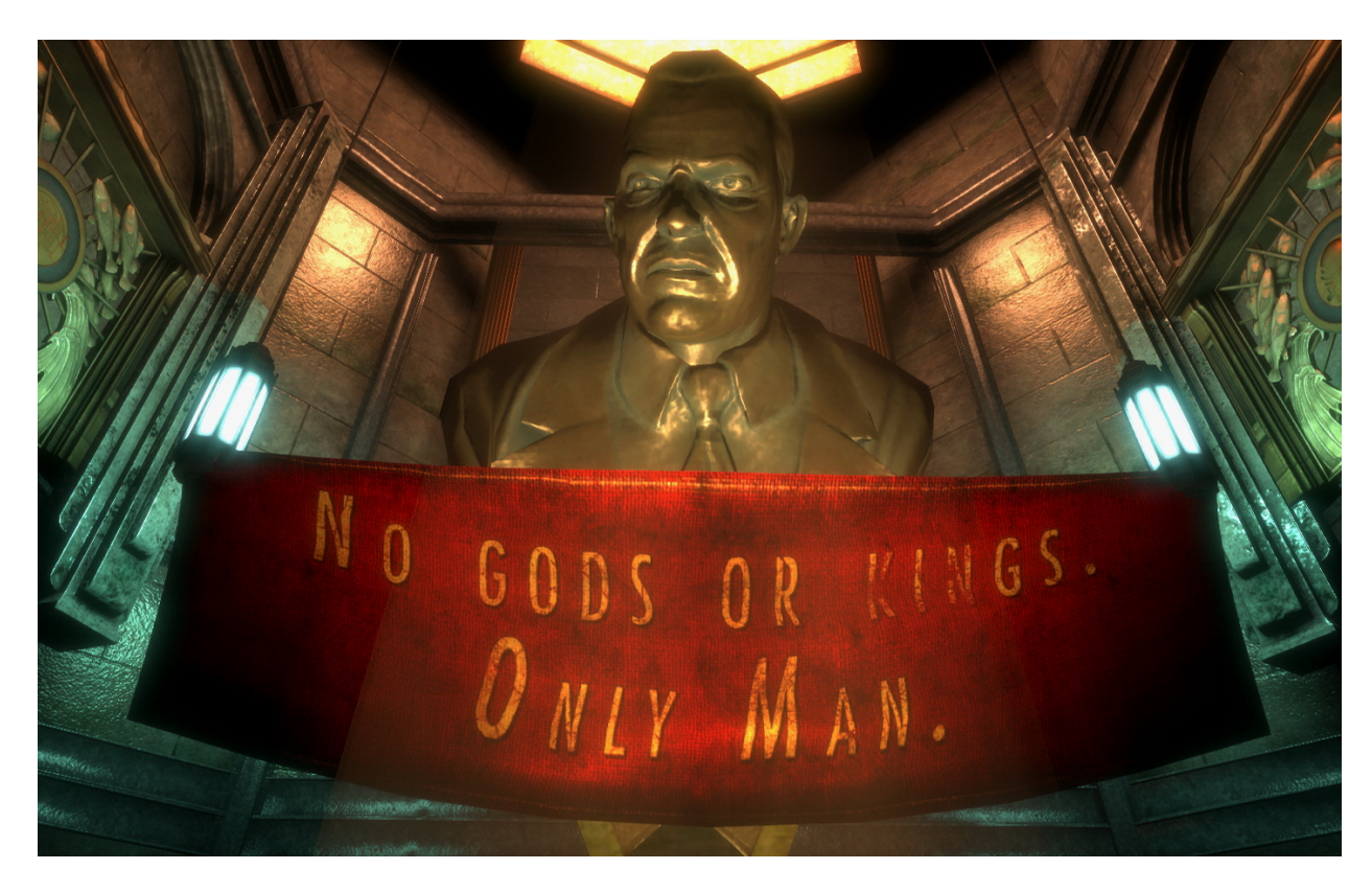
[Pictured above: A statue above the entrance to Rapture<sup>31</sup>]

and corruption the game seems to argue is inevitable when humans are unregulated.