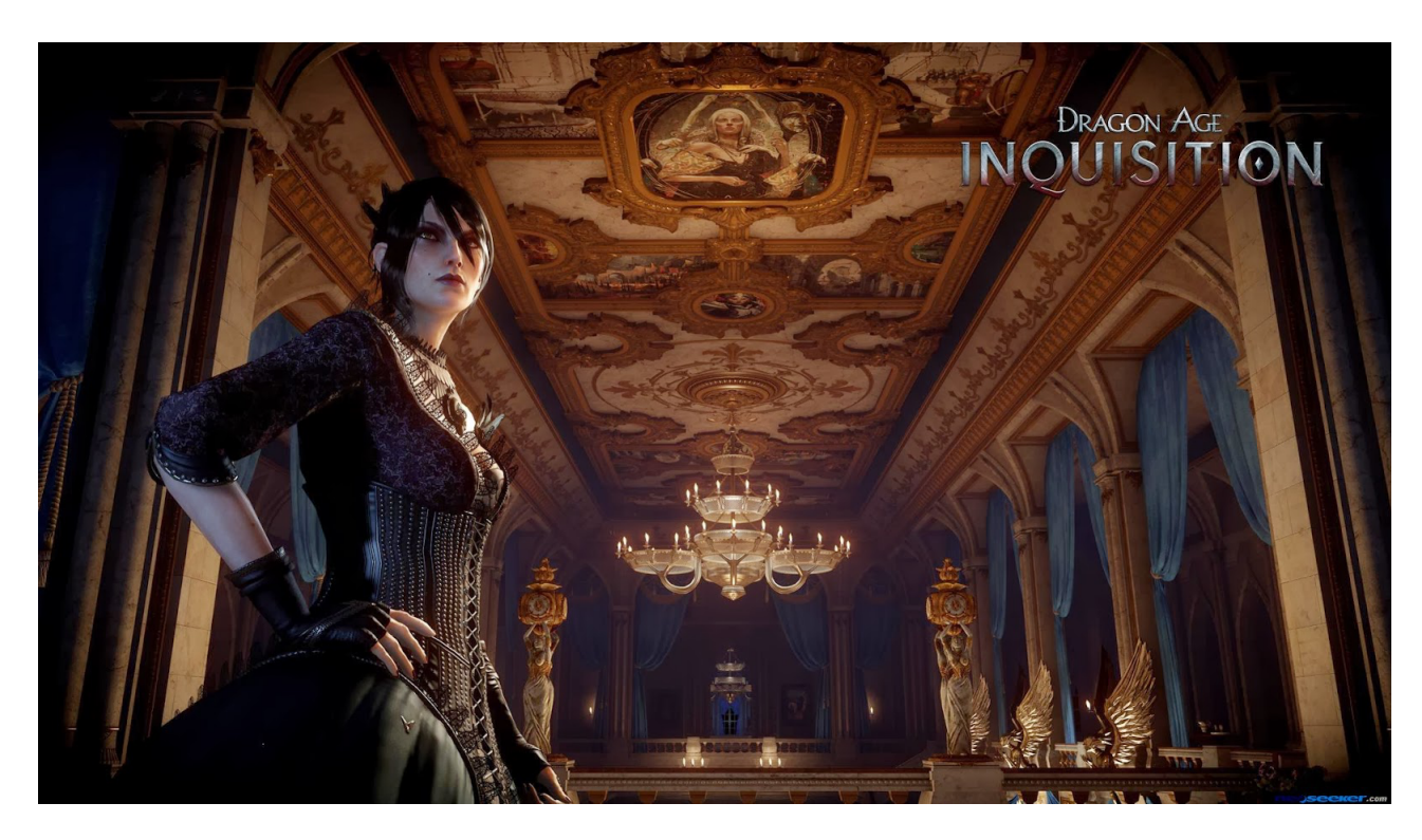
[Pictured above: Morrigan Concept Art from Dragon Age: Inquisition <sup>45</sup>]

The Warden in this way functions as a sort of Jason figure: through his or her intervention Morrigan, like Medea, is removed from her barbarian homeland, journeying into civilization and eventually becoming acculturated.