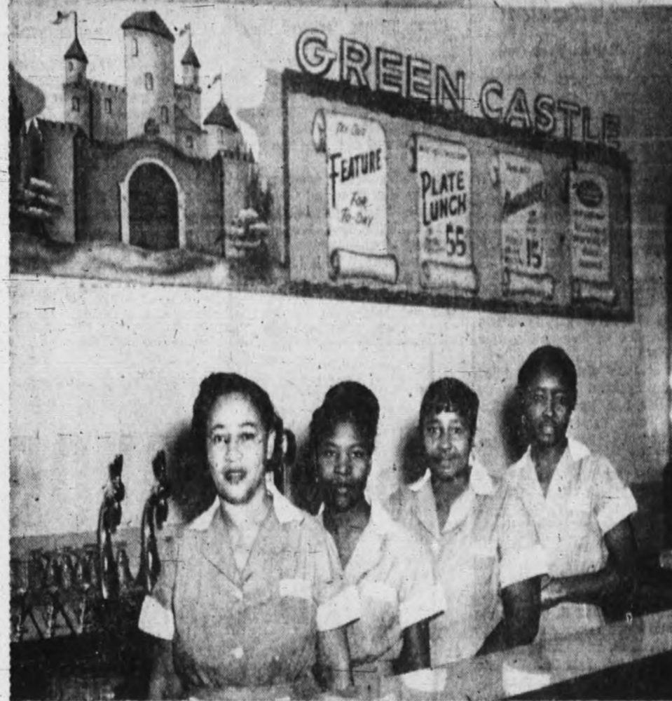
Top Photo shows the outside of the GREEN CASTLE CAFE with a bevy of lovely waitresses shown at bottom, ready at all times to give you prompt and courteous service. Give them a trial and see what really happens. Good food at all times.