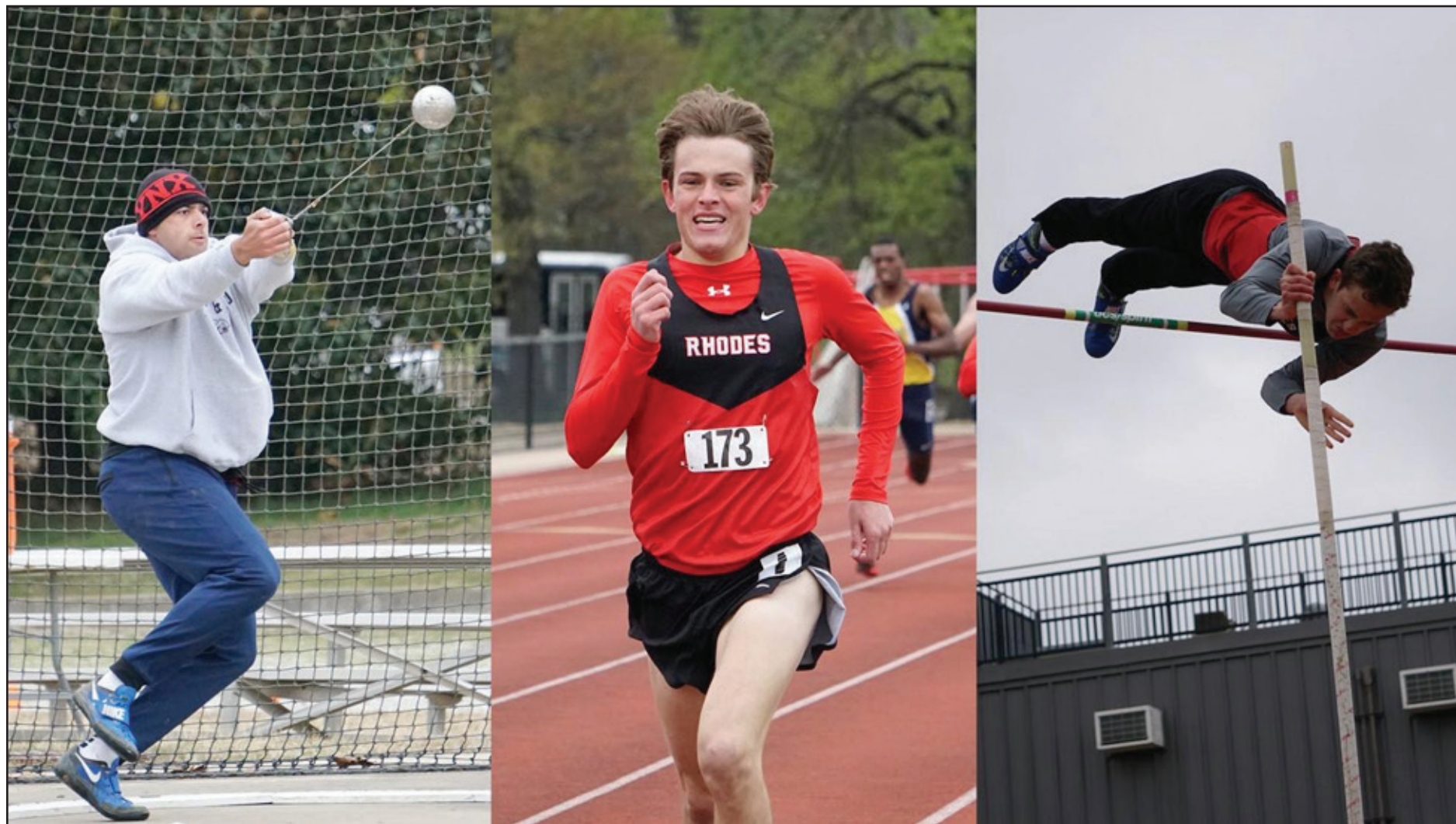
The Lynx track and fielders are bundled up to combat the cold and wind.