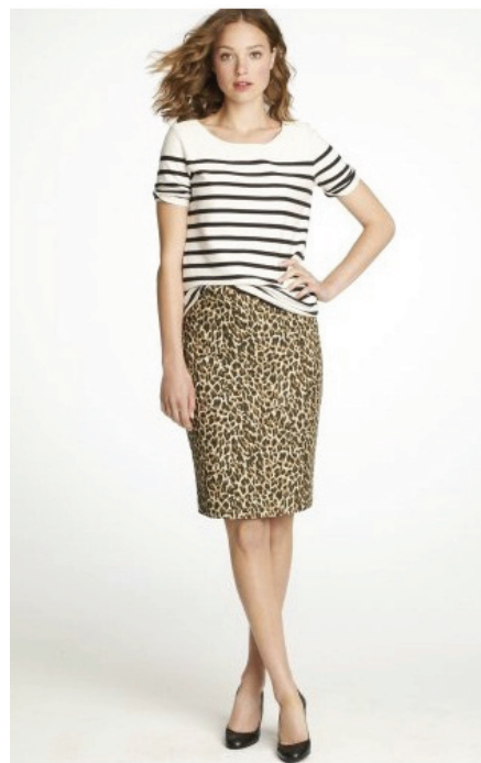
One way to make a bold statement this fall.

Avoid all weather-related crises this season by arming your closet with some fun, colorful layers or add a cool twist and pair unique separates. For further inspiration, check out pages 135 and 140 of the October issue of Seventeen or page 368 in Elle! magazine. And remember, being fashionable is not as hard as it looks.