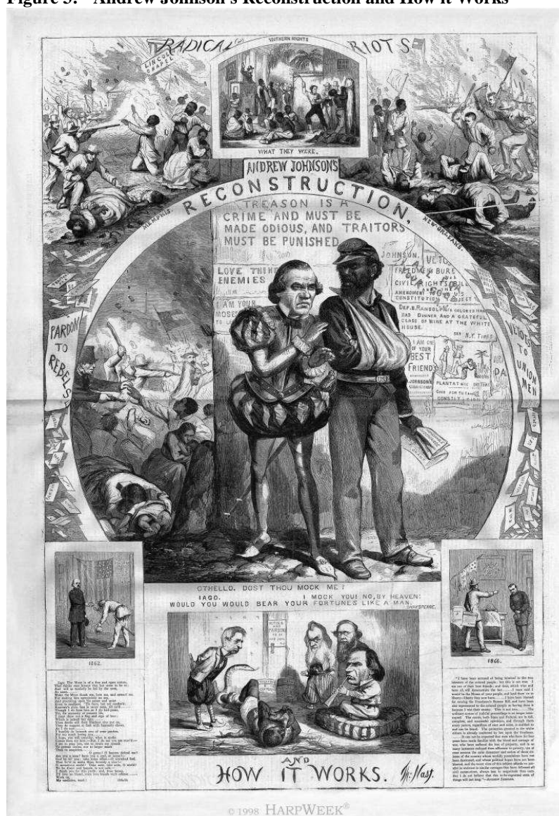
Figure 3: "Andrew Johnson's Reconstruction and How it Works"

Thomas Nast's cartoon in the September 1 issue of Harper's Weekly (figure 3), which prominently featured the Memphis massacre and the deficiencies of presidential reconstruction, exemplified the characteristics of Nast satire. Nast titled the cartoon "Andrew Johnson's Reconstruction and How it Works" and loaded it with layers of commentary, sometimes explicit and sometimes subtle.