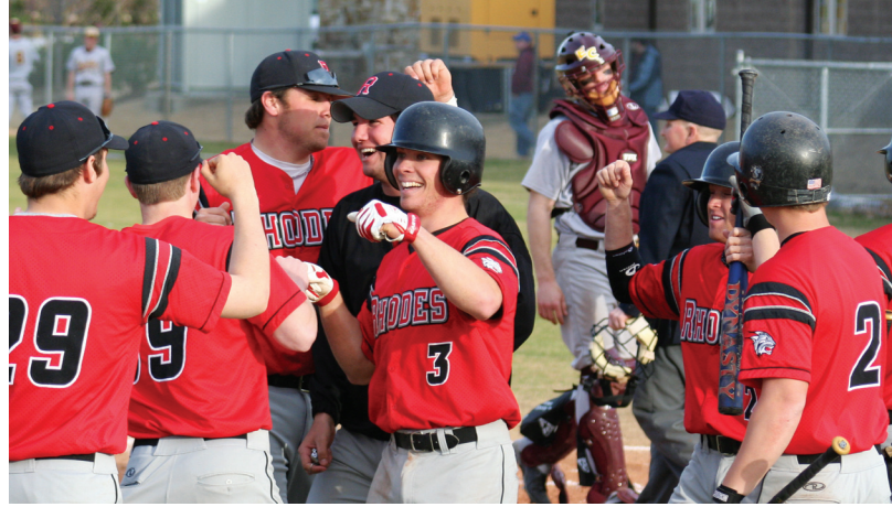
The Lynx varsity teams compete in NCAA Division III and have a proud tradition of success in the Southern Collegiate Athletic Conference.

Recreation, fitness and athletics are an important element to the Rhodes experience for many of our students. At Rhodes, you will have some of the finest recreational facilities anywhere in the country.