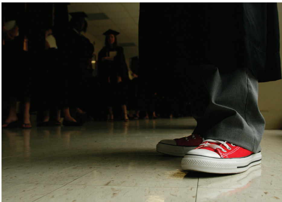
Launched at Rhodes in 1992, the pioneering Bonner Scholars community service and leadership program is now offered at 25 colleges across the nation. Bonner Scholars earn $10,000 annually, a stipend and additional awards. They also get to wear red sneakers at graduation.

Educated villagers in Zambia about HIV/AIDS prevention