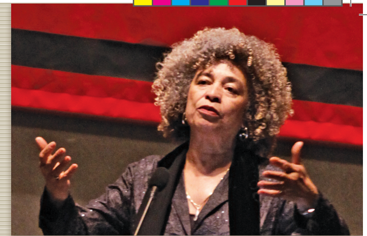
Dr. Angela Davis - keynote speaker, ACS 8 th biennial Women's and Gender Studies Conference