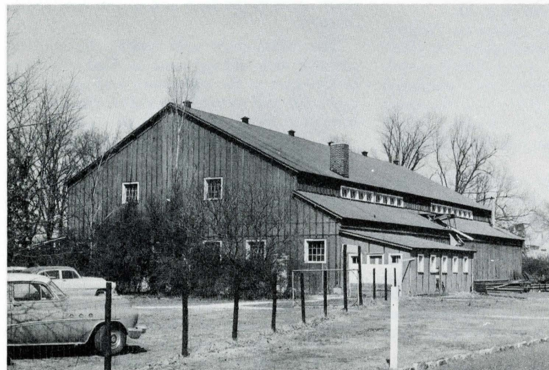
Farewell to Fargason Field House, which saw its last basketball game on February 20. It is pleasant to report that the curtain was rung down with a win and that the opponent was so worthy a rival as Sewanee. No decision has been reached concerning the eventual fate of the twenty-nine-year-old Fargason.