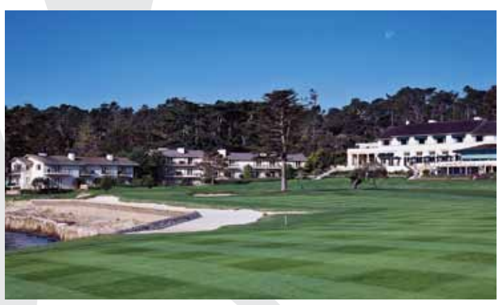
Pebble Beach Golf Links® #18

The Spa at Pebble Beach The Spa at Pebble Beach was rated third in Travel and Leisure 's Top 20 Hotel Spas in the World. Relax, rejuvenate and revitalize your body and spirit in a full-service spa and salon nestled in the heart of Del Monte Forest. Choose from