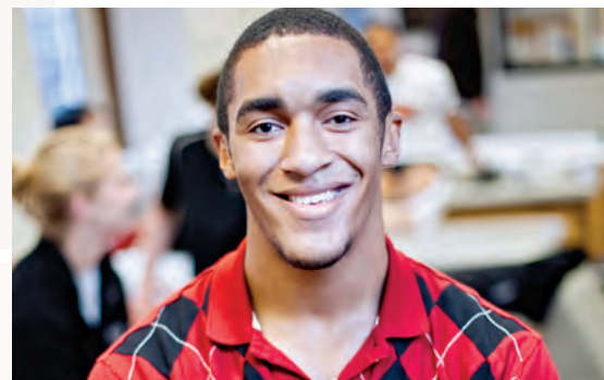
Harrison participates in leading-edge research projects at St. Jude Children's Research Hospital.