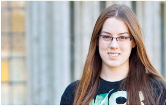
Rhodes' location in Memphis is the perfect fit for Abby.