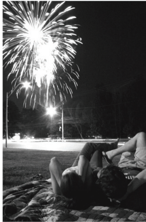
When an annual celebration of independence does not express your daily affections, you could try setting off real fireworks.