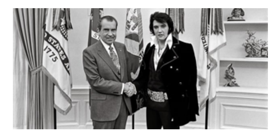
The image above is of Richard Nixon shaking Elvis Presley's hand in December, 1970. 168