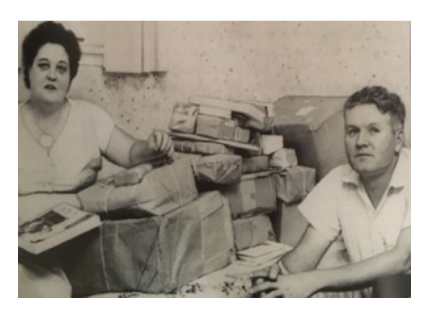
The image above is of Gladys and Vernon Presley in 1034 with just a sampling of Elvis' fan mail. 100