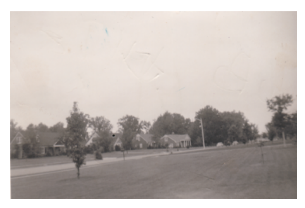
A view of Audubon Drive from the front of 1034 looking northwest.