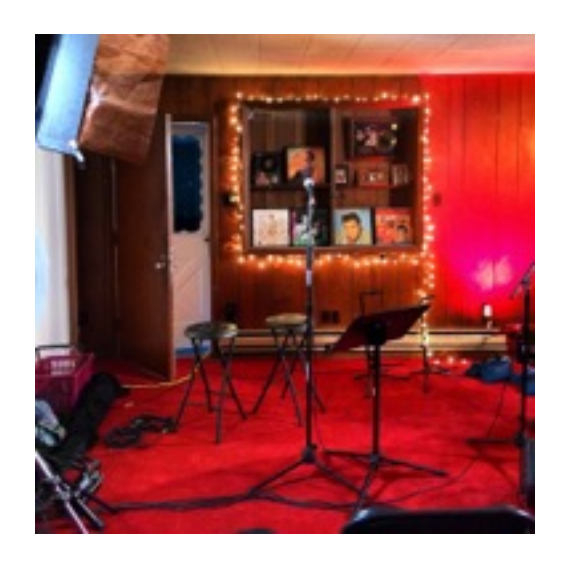
The image above shows the setup of An Evening at Elvis' episode before the concert. 157