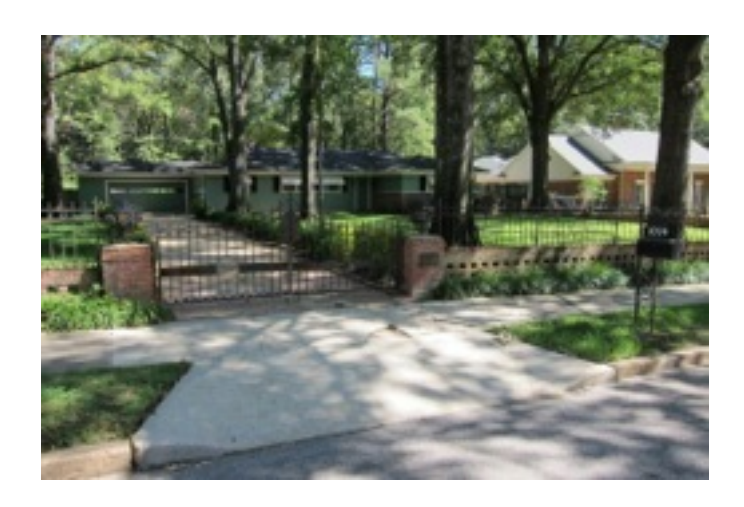
The image above is what 1034 Audubon Drive looks like today. 156

keeps people on the street and connected with each other for so long. Even after they move or pass away, their spirit remains.