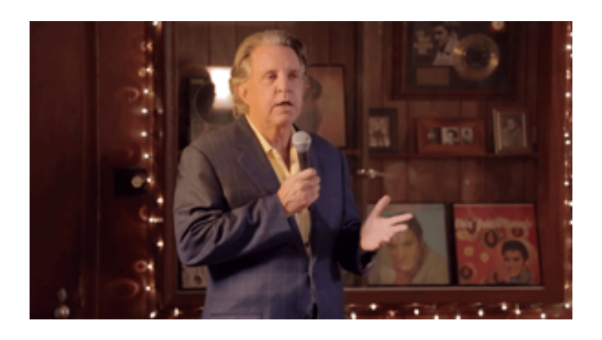
The image above is of Mike Curb in 1034 at an episode of An Evening at Elvis'. 144