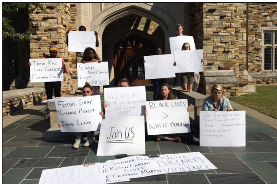
"Within the Gates": Not just a part of greater Memphis, a Black Lives Matter protest formed outside Barrett.