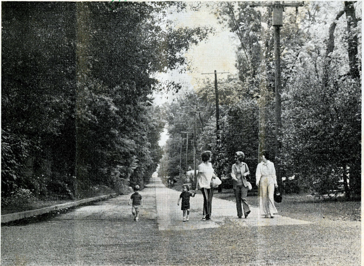
Contested plans call for a six-lane interstate to replace this bus route through Overton Park.