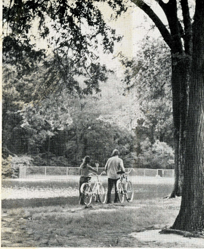
Above —Quiet conversation comes naturally when the wind murmurs through the lakeside trees. Right —A picnic in the shade offers a quiet rest from more strenuous activities in Overton Park.