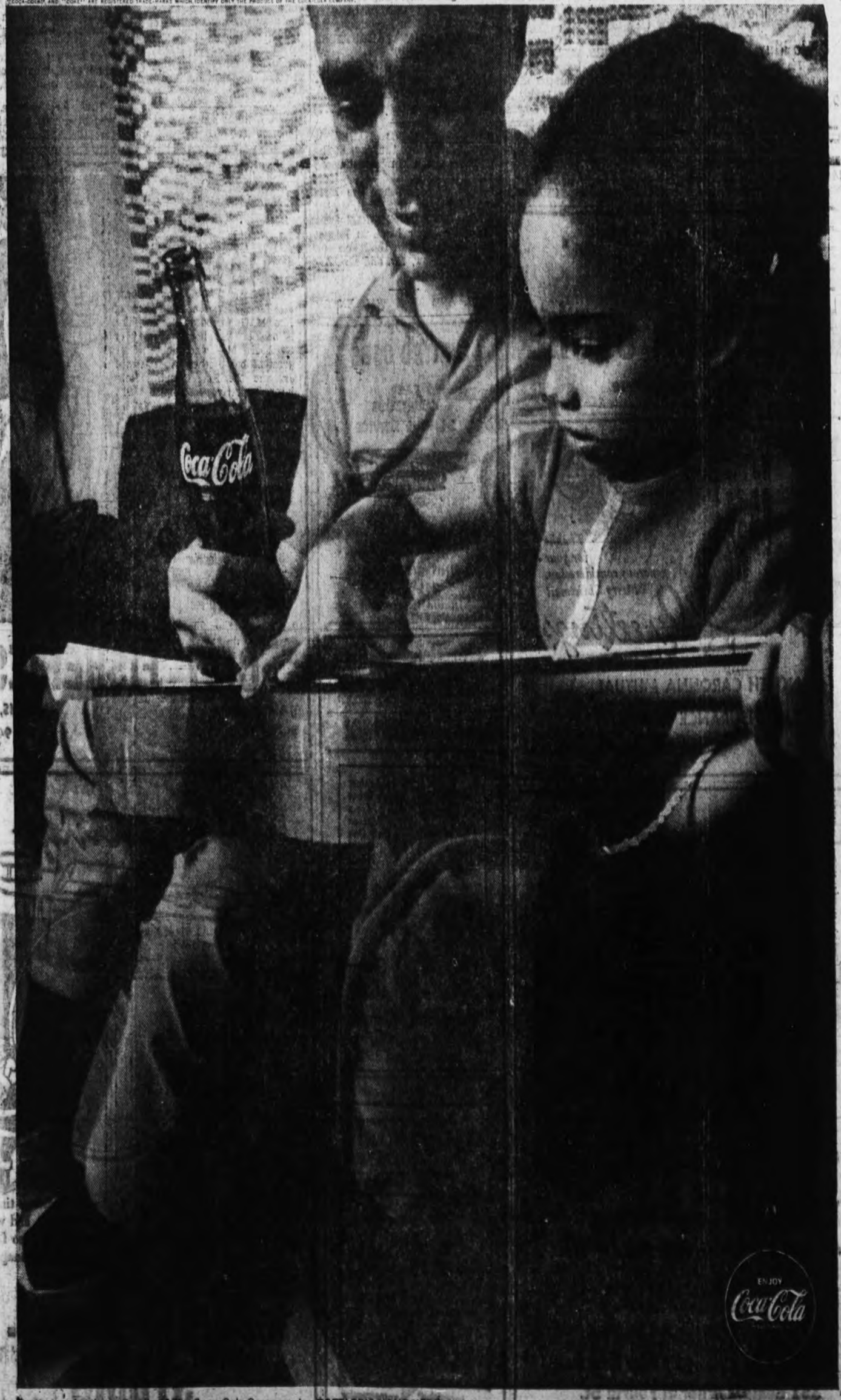
Bottled under the authority of The Coca-Cola Company by: BOTTLER'S NAME HERE