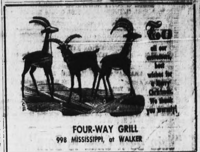
FOUR-WAY GRILL 998 MISSISSIPPI, at WALKER

I hope we shall never forget that we created this nation, not to serve ourselves, but to serve mankind. —Woodrow Wilson A half truth does no damage to your thinking if you have sense enough to recognize it.