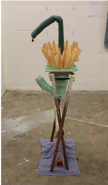
Untitled Bed Feelings

yarn, cherry, umbrella, traffic cone, duct tape, soda can, plastic dinosaurs, latex paint, belts, wooden portfolio stand, coconut oil, raspberry tea bags, embroidery thread, towel, lipstick