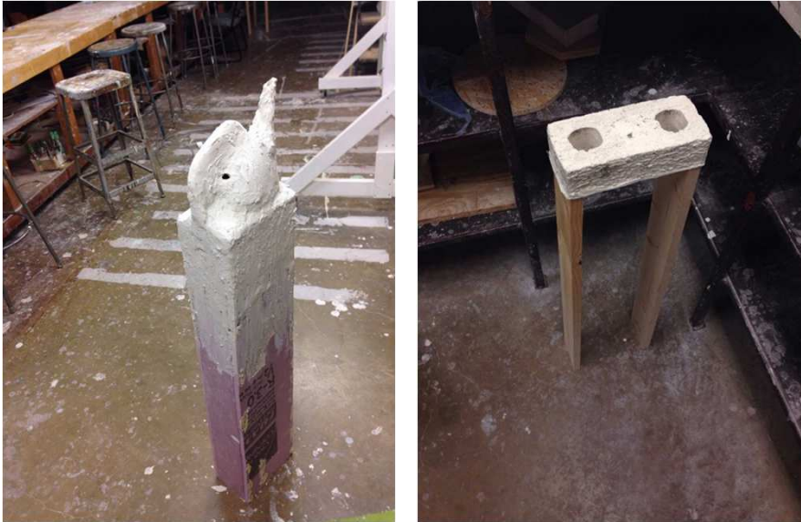
Overworked, kept breaking, not cute