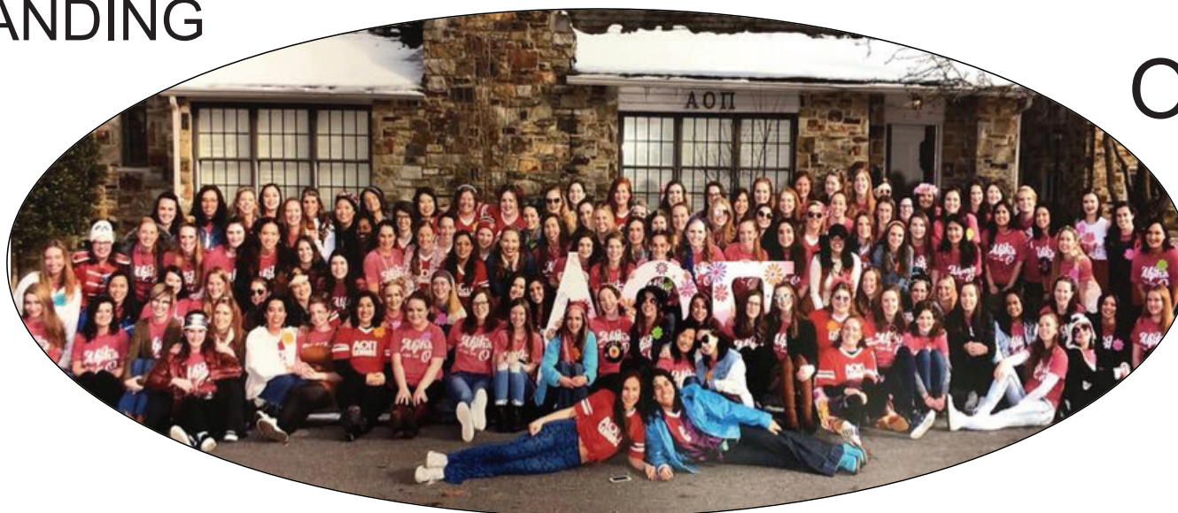
FOR DEMONSTRATING TRUE SISTERHOOD IN INVITING A TRANS WOMAN INTO THEIR SORORITY. WE ARE STRONGER TOGETHER.