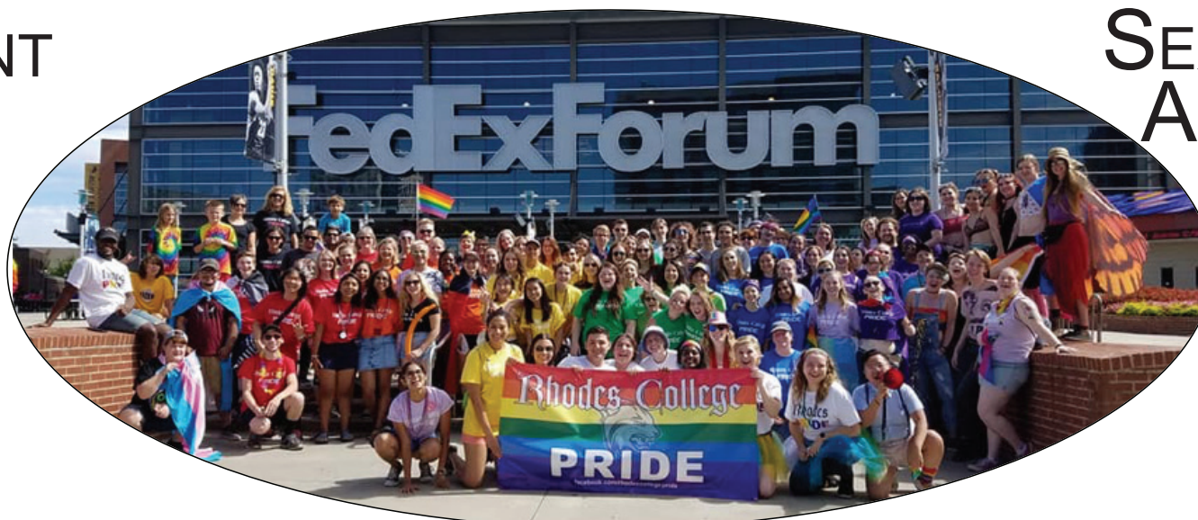
FOR A METICULOUSLY PLANNED 25TH ANNIVERSARY CELEBRATION SHOWING THE STRENGTH OF INCLUSIVITY.