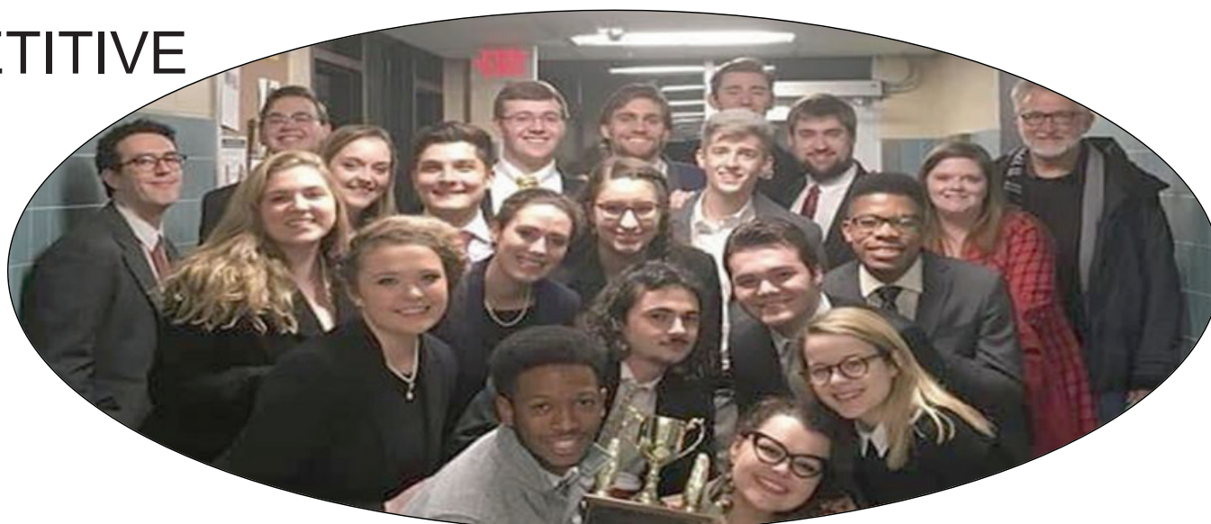
FOR TREMENDOUS HARD WORK AND ACHIEVEMENT WHILE CEMENTING THEIR STATUS, NATIONALLY, AS A FORCE TO BE RECKONED WITH.