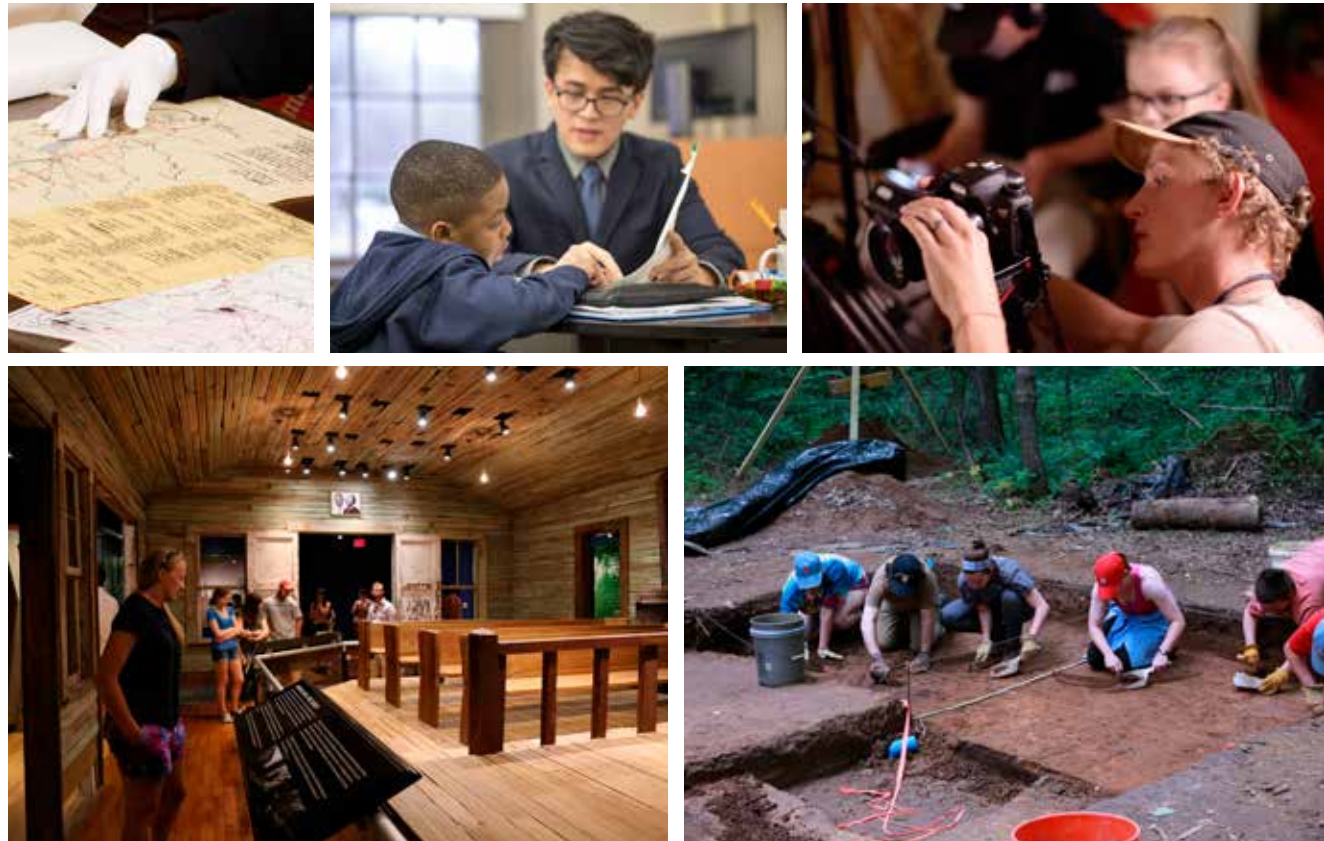
Programs and initiatives under the umbrella of the Turley Memphis Center include the Shelby Foote Collection, Rhodes Learning Corridor, the Mike Curb Institute for Music, the Rhodes Institute for Regional Studies, Crossroads to Freedom, and the Rhodes Archaeological Field School.

In the coming days, 10 students will be named Turley Fellows, and they will take on a collaborative role with faculty to track the impact of the Center. They will consider metrics such as the percentage of Rhodes students that stay in Memphis after graduation, the number of community partnerships formed since the Center's expansion, the diversity of student and faculty participants, and the engagement of Memphians from a variety of neighborhoods. Fellows will also undertake individual projects connected to the primary areas of focus.