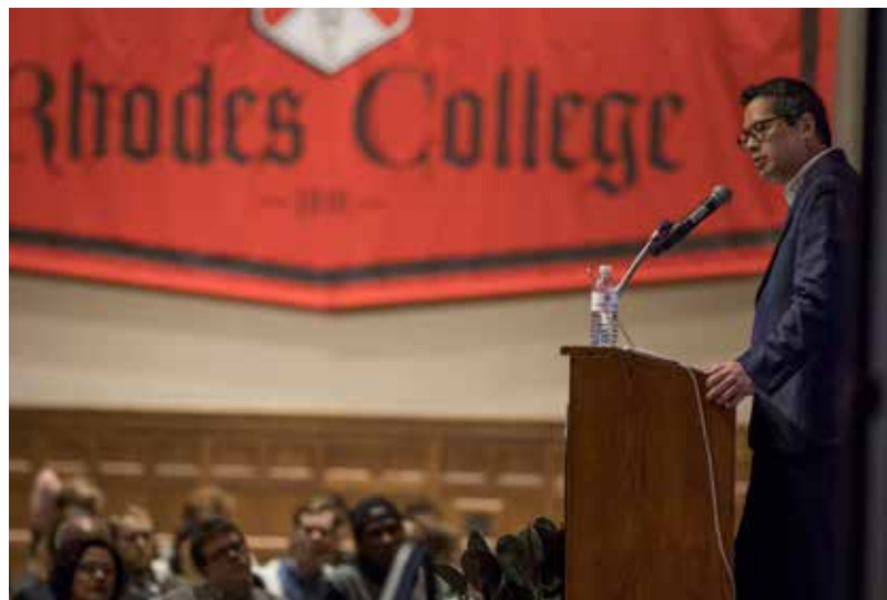
Acclaimed author and educator Jeff Chang spoke at the opening celebration for the Lynne and Henry Turley Memphis Center.