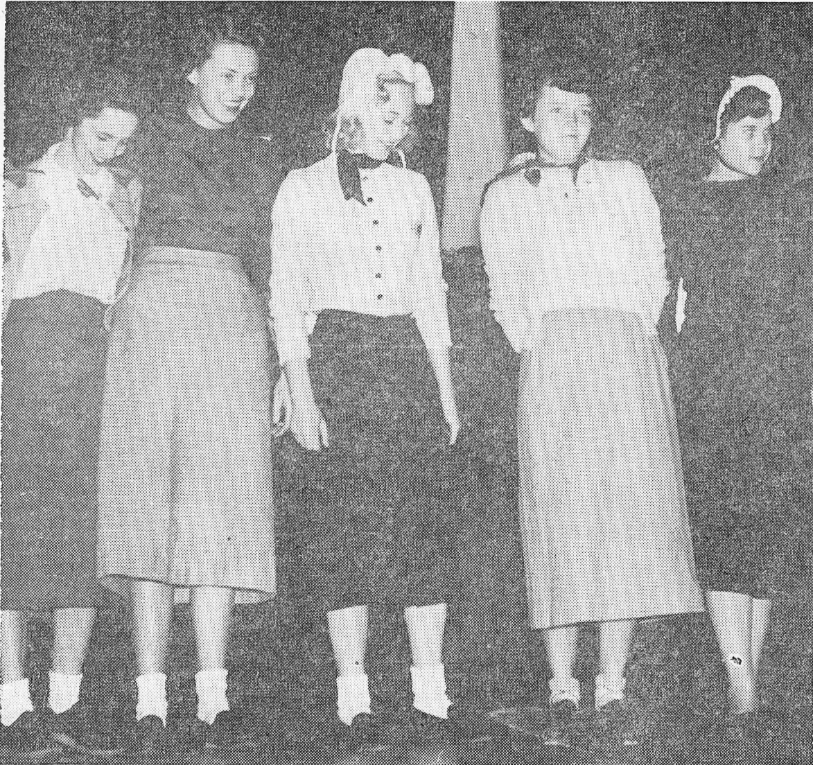
Freshmen girls, entertaining upperclassmen with song and dance, perform on Hardie's stage. Other freshmen assembly programs have featured the Southwestern Blues Singers and a fashion show given by devastating Beale Street beauties.