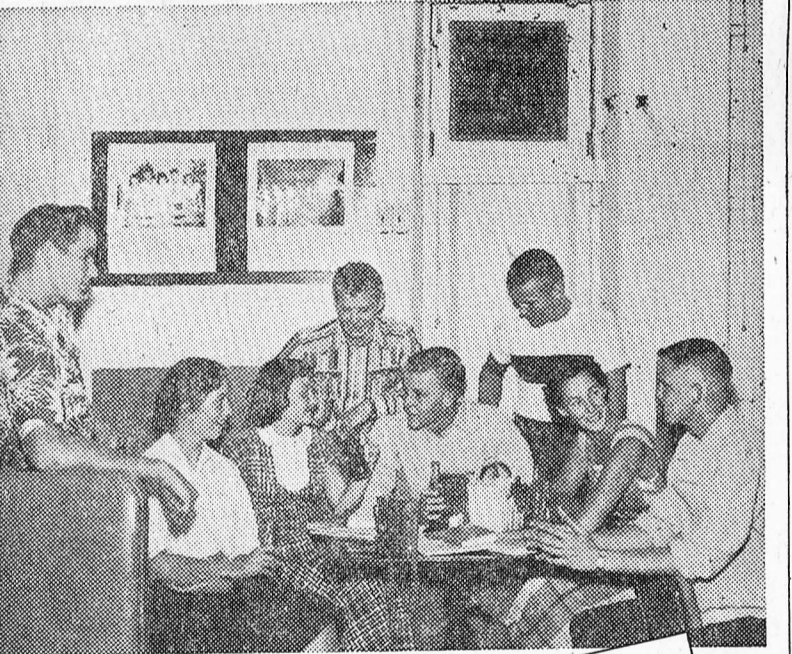
Co-op University of Arizona Tucson, Arizona