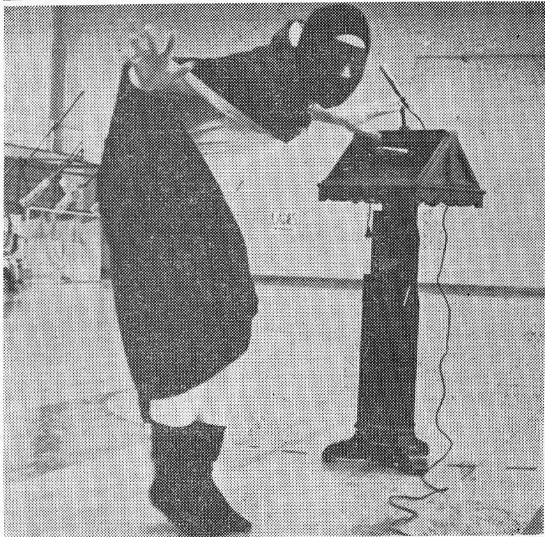
BATMAN PROMISES the end of speed breakers and tuition raises. The masqued crusader accidentally crashed the Batmobile through the front door of the gym after he hit a speedbreaker doing 140 miles an hour in pursuit of the Gargoyle.