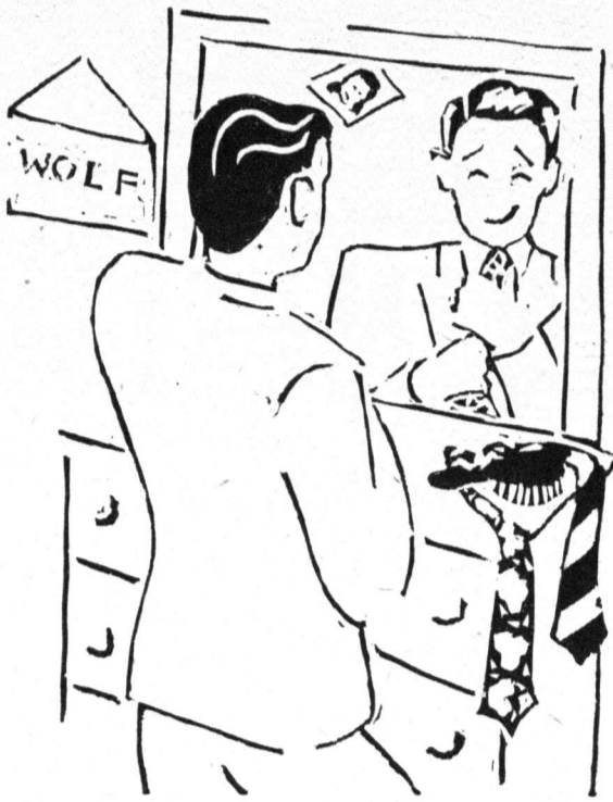
Wolf—"Today I've got to look my best; the Press convention's in town."