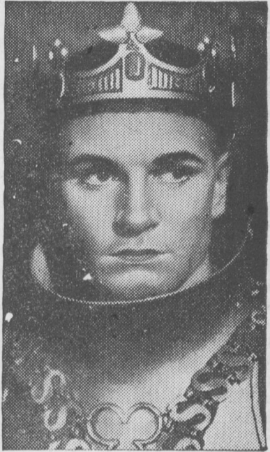
LAURENCE OLIVIER AS "HENRY V" in the famous Theatre Guild film hit, opening its only Memphis run at the Ritz Theatre on Wednesday evening, December 4. There will be only two shows a day, 2:30 and 8:30, including Sunday, and all seats will be reserved.

Laurence Olivier, whose recent appearances on Broadway as leading member of the Old Vic company, have catapulted him into first rank as an actor, not only