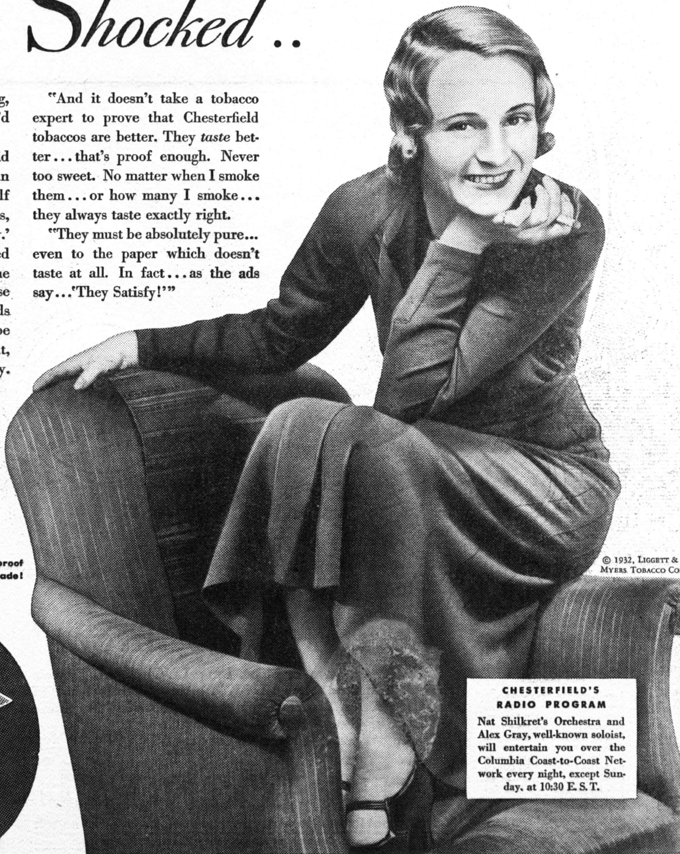
© 1932, LIGGETT & MYERS TOBACCO CO.

"They must be absolutely pure... even to the paper which doesn't taste at all. In fact...as the ads say... 'They Satisfy!'"