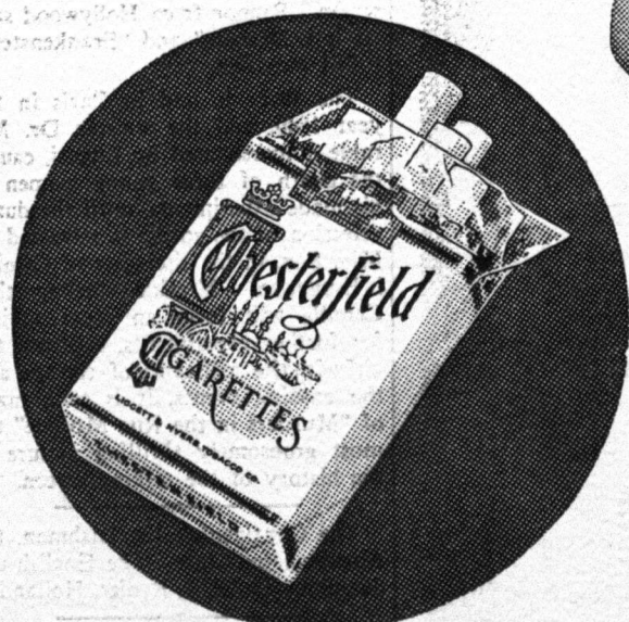
● Wrapped in Du Pont Number 300 Moisture-proof Cellophane...the best and most expensive made!