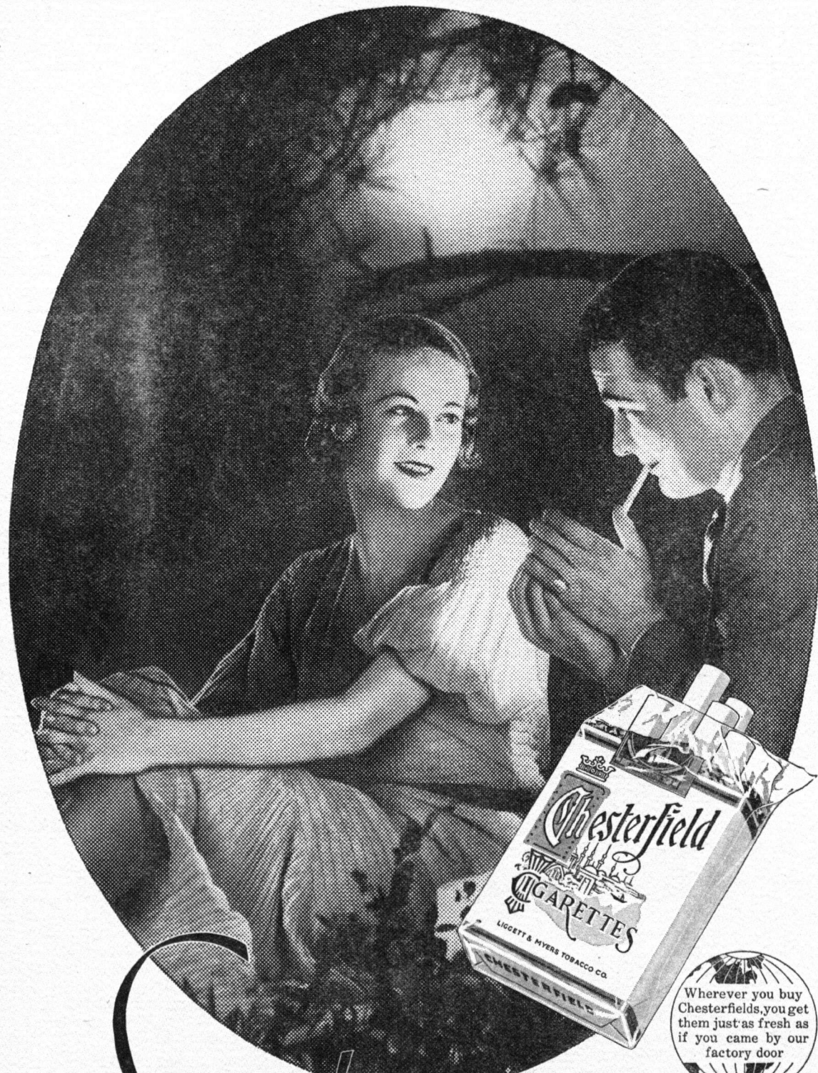
Wherever you buy Chesterfields, you get them just as fresh as if you came by our factory door