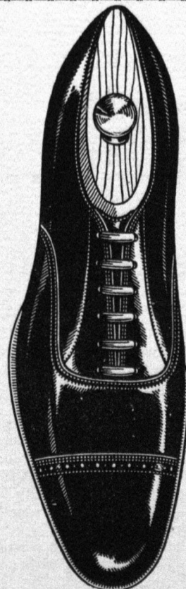
THE SPRUCE Brown or Black Calf

Geo. T. Brodnax INCORPORATED Gold and Silversmiths MEMPHIS