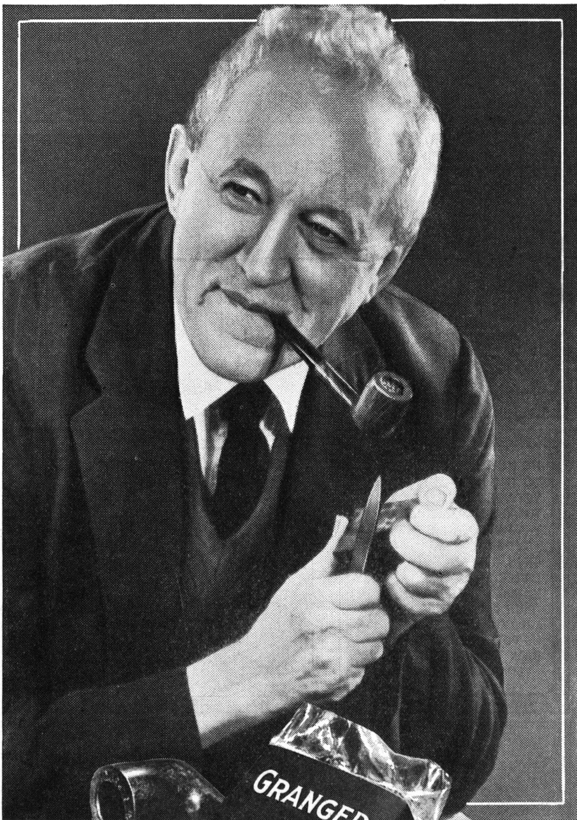
© 1933 LIGGETT & MYERS TOBACCO CO.