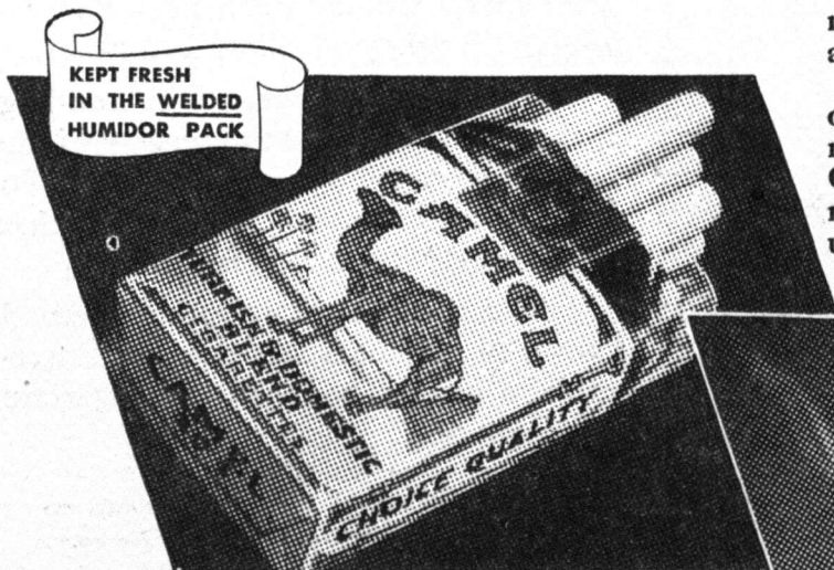
Copyright, 1933, R. J. Reynolds Tobacco Company

Keep the air-tight, welded Humidor Pack on your Camels... to assure yourself and your companions a fresh, cool smoke.