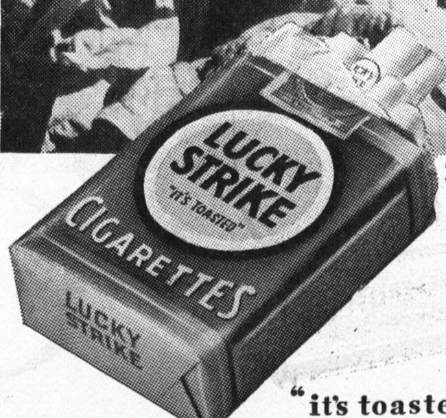
Copyright, 1933, The American Tobacco Company.

Not many smokers have seen a fine tobacco plant in full bloom, so we show you this picture. Only a few of these fine plants are permitted to flower and to produce seed. These carefully selected seeds reproduce the following year the "Cream of the Crop" for your Lucky Strike, for tobacco must be grown from seed each year. This careful breeding of fine tobaccos explains why Luckies maintain the same fine, uniform quality from year to year—so round and firm and fully packed—free from loose ends.