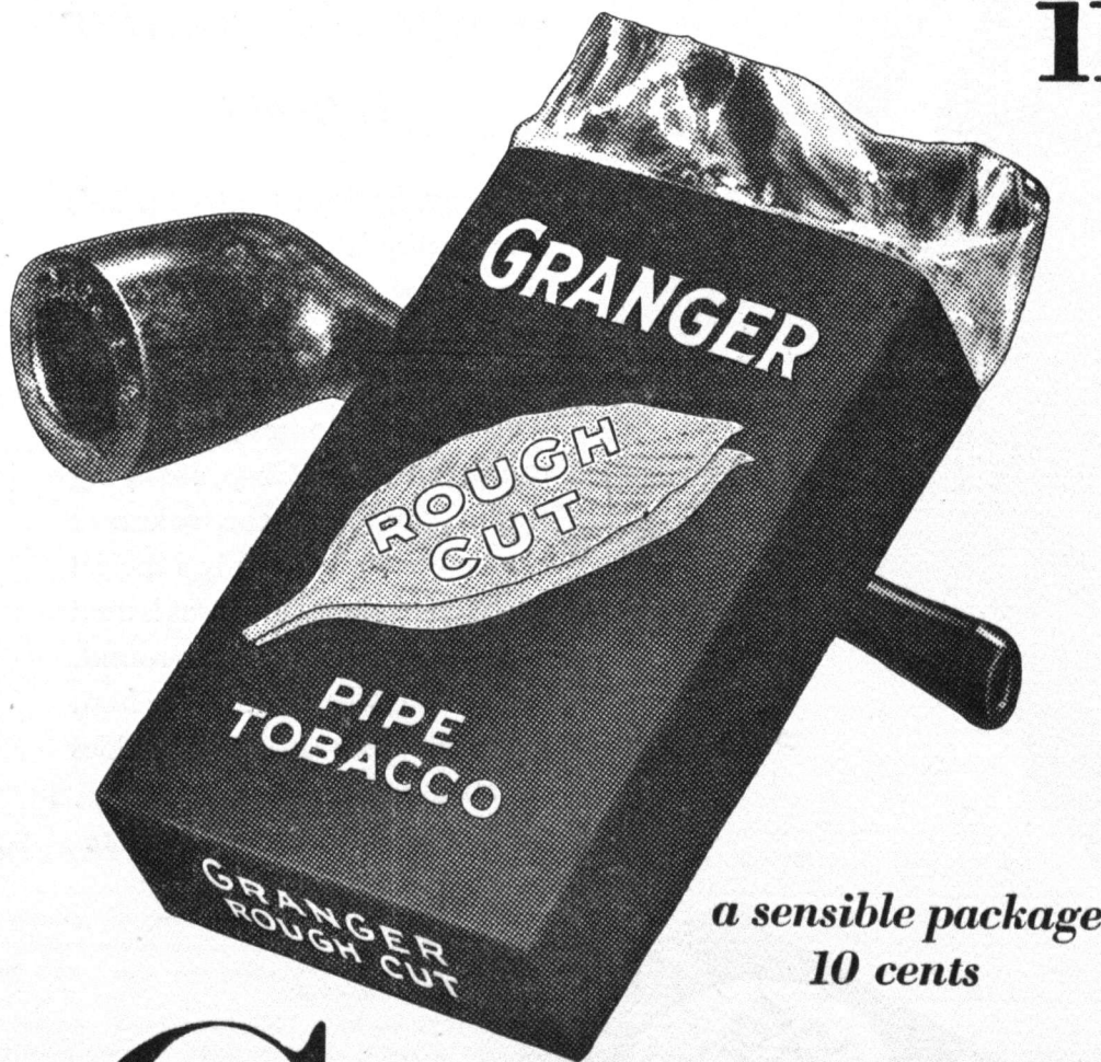
a sensible package 10 cents

... is tobacco that's made to smoke in a pipe. This means the right kind of leaf tobacco—the kind that grows for pipes.