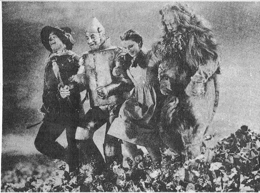
The Social Commission's Thursday Night Movie this week will be THE WIZARD OF OZ (1939), starring Judy Garland, Ray Bolger, Jack Haley, Bert Lahr, and Frank Morgan as the Wizard. This movie would have swept the boards on Oscar night had it not been for a movie called Gone With the Wind.