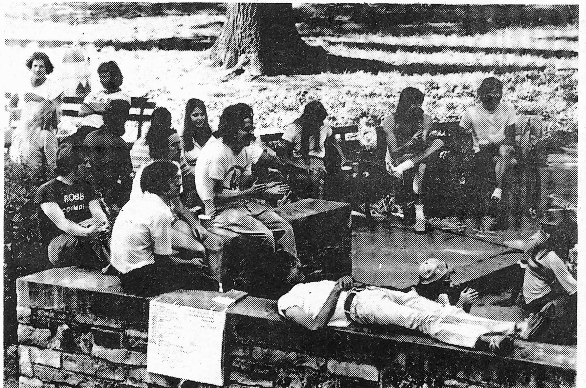
Whiteball spectators enjoy refreshment, rest and relaxation during tournament action.

The tournament was a complete success—the players had a blast playing, and the spectators had a blast drinking. A capacity crowd of rowdies similar to those who have been seen getting into the action in recent British soccer matches was on hand to amplify the aura on the Whiteball court. The only sour note of the tourney occurred when the Mosquito Bombers showed up to feast on the spectators. The time of the tourney was 14 hours and 10 minutes. The attendance was estimated at 278. A splendid time was enjoyed by all.