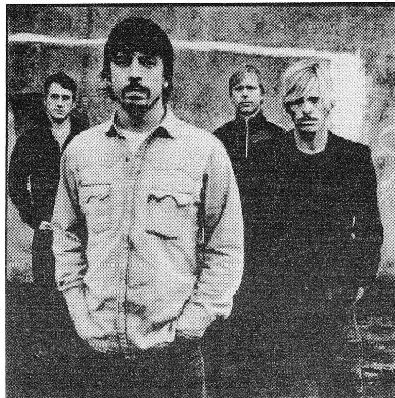
A photograph from the press release of the Foo Fighters newly-released One by One, which hit stores on October 22. This is the Foo Fighters sixth CD release, featuring a new guitarist and a guest appearance by former Queen guitarist Brian May. The album features 11 new songs, one of which, entitled "All My Life," has already received significant attention through radio play on the alternative stations.