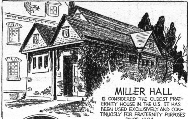
MILLER HALL IS CONSIDERED THE OLDEST FRATERNITY HOUSE IN THE U.S. IT HAS BEEN USED EXCLUSIVELY AND CONTINUOUSLY FOR FRATERNITY PURPOSES SINCE 1884. PHI KAPPA PSI - GETTYSBURG COLLEGE