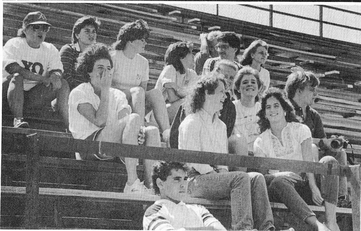
A mix of Rhodes students enjoy themselves on a warm afternoon during Saturday's soccer game against Principia. Rhodes lost in overtime, 0-1.