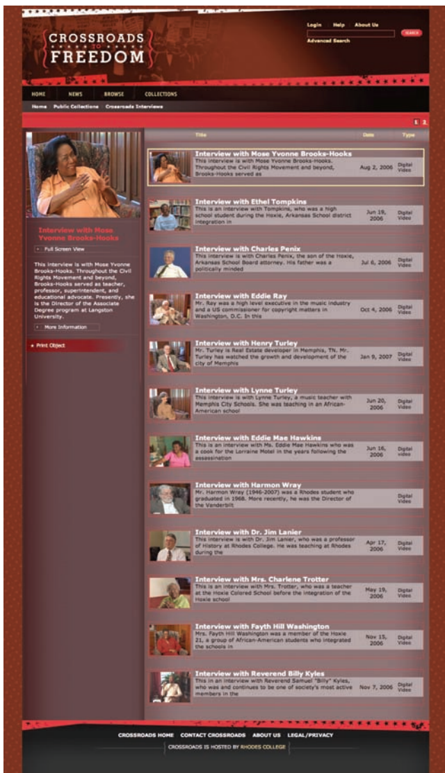
Menu of video interviews on the Crossroads to Freedom Web site