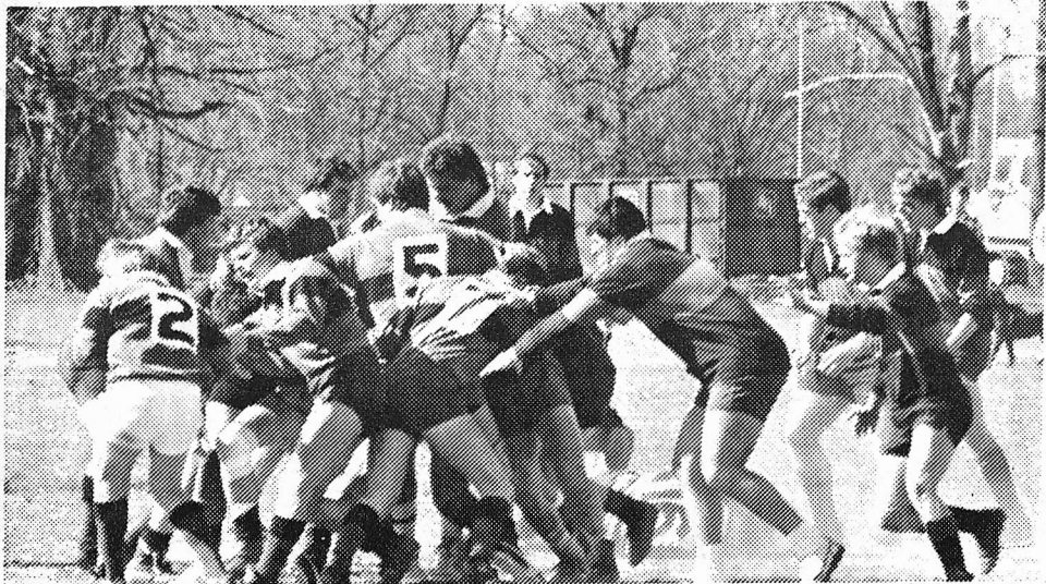
It was a free-for-all on the Back 40 last Saturday when the Rhodes Rugby Club defeated Old No.7, 17-10.