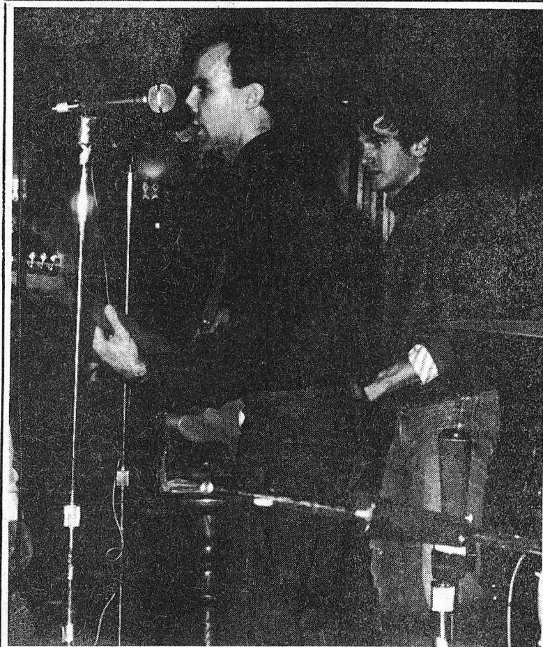
Southwestern partied all night long to the music of Barking Dog last Friday in the Pub.

For a copy of the 1983 directory, send $2.00 to cover first class postage and handling to: Cape Cod Summer Job Bureau, Box 594, Barnstable, MA 02630.