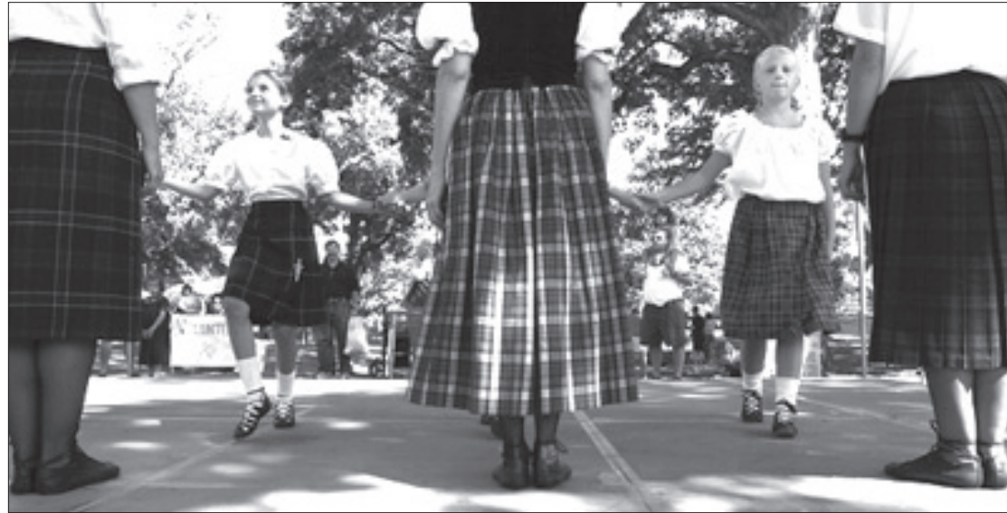
Dancers wearing their family tartans exhibit traditional Scottish dancing for onlookers at the Clanjamfry festival.