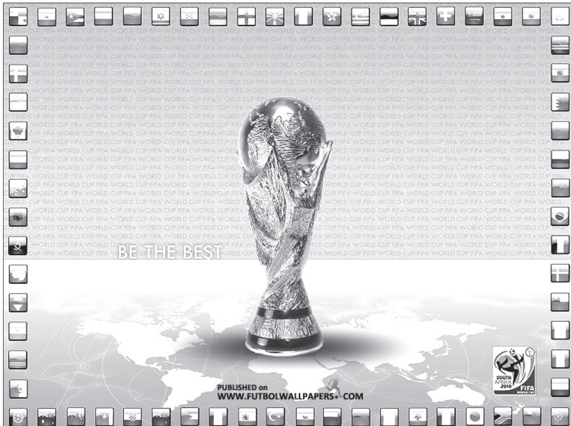
World cup is coming to South Africa on June 11.

While these teams are some of the bigger names in the sport, it is hard to not cheer for the underdog nations. All 32 teams are top notch contenders and have well deserved a spot (maybe not France) in this event. Soccer is an unpredictably beautiful game and on June 11 South Africa will hope to continue the tradition of the World Cup.