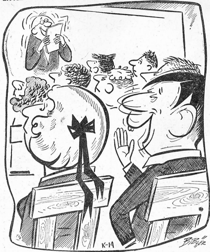
"One big advantage in having to take this course over is that I know when I'm supposed to laugh."